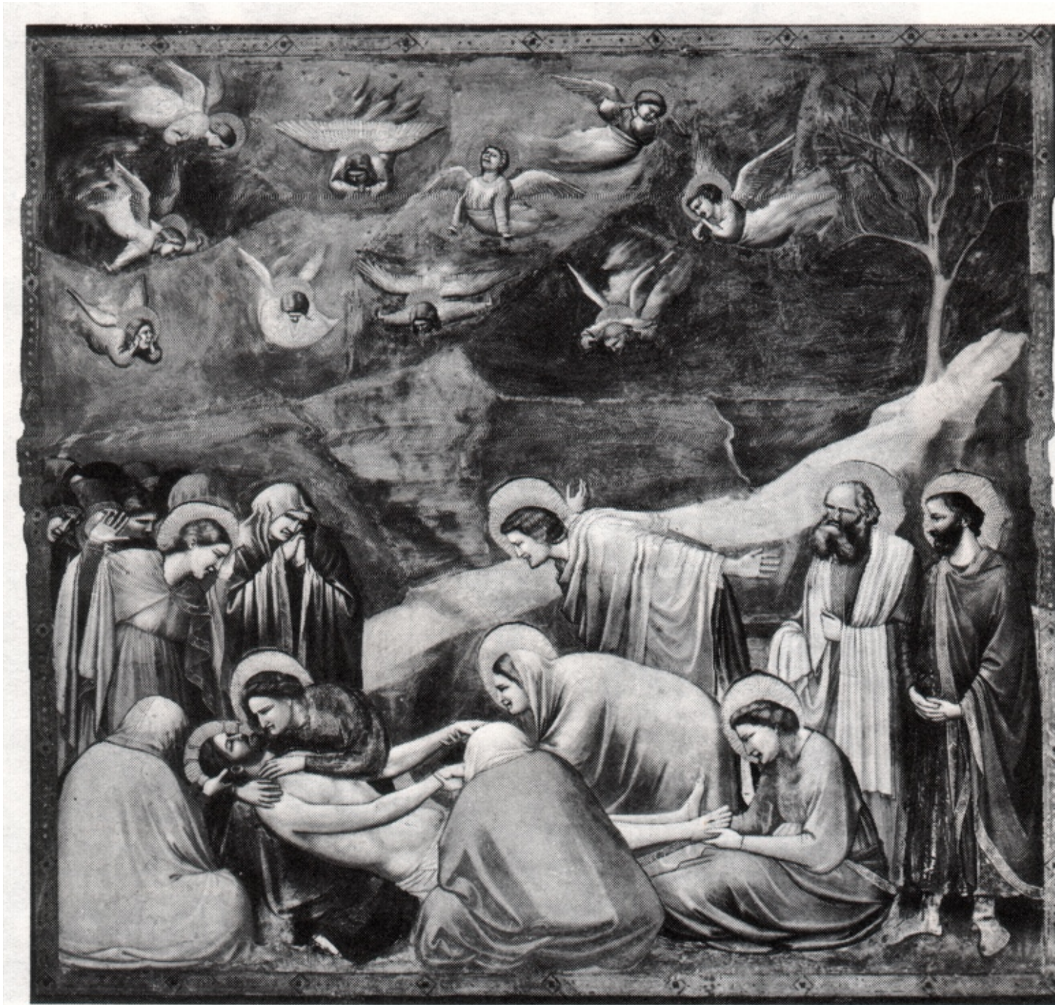
Giotto (Florentine, 1266?-1337) THE LAMENTATION, 1305-1306; the Scrovegni Chapel, Padua