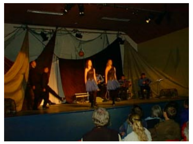
Figure 9. Ragus Irish dancing on Inis Mor (Big Island).