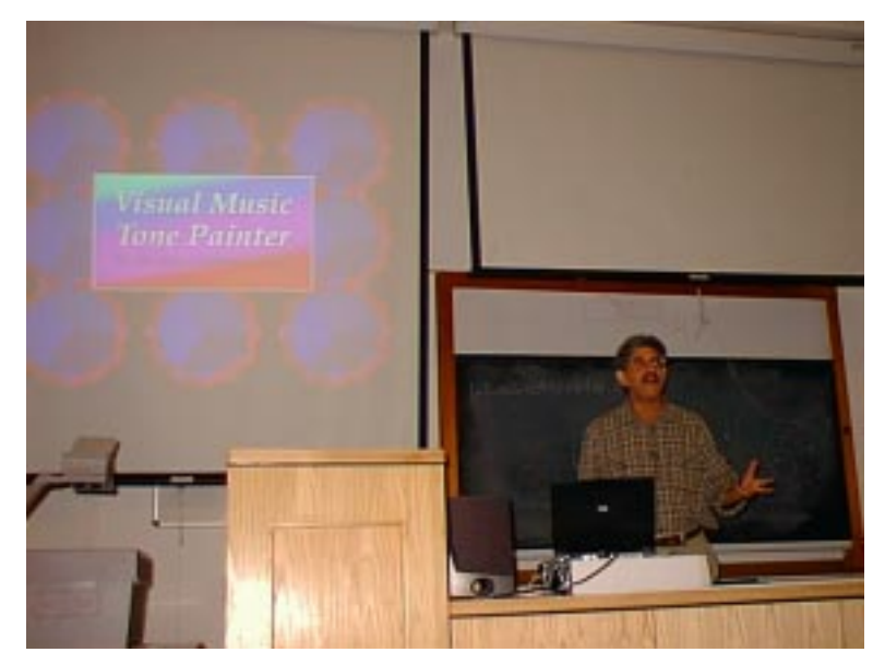
Figure 2. Stephen Nachmanovitch.

and the violin", "Visual Music Tone Painter (synesthesia software)" and "Creativity: stone and lava".