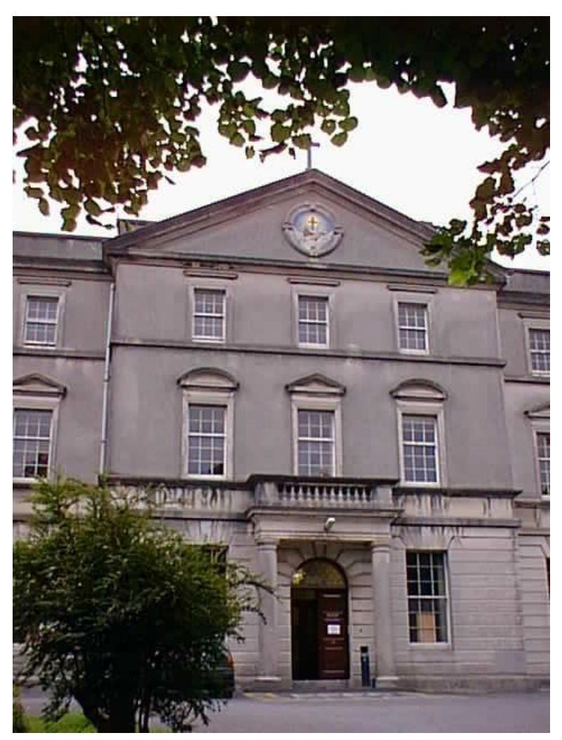
Figure 1. St. Anthony's College building.

from both Humanities and Engineering in response to the following Call for Papers: